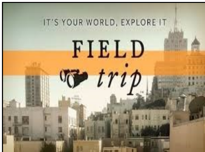
Gr.4 -3rd yr. Jan. 28 PS-Gr. 3 Jan. 29