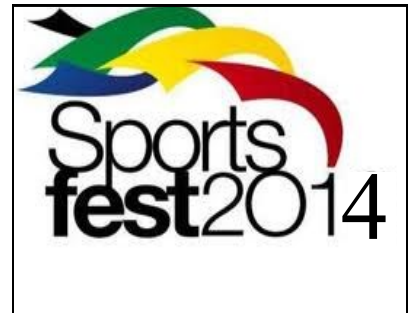
HS Intrams-Feb.7 / GS Sportsfest Feb.8 PS Family Day-Feb. 15