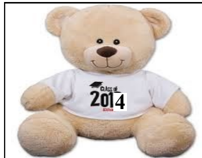
Seniors - Feb. 1 / PS-HS Feb. 4-5