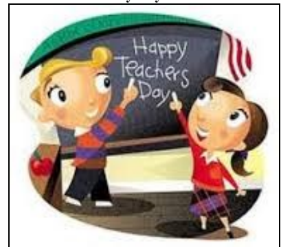
Feb. 14 Teacher's Day / Mr. & Ms. TLA